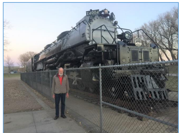
The Union Pacific 'BIG BOY' locomotive – 8 driving wheels

When we left Moab heading east, we followed the Colorado River all the way to Grand Junction . The roads were excellent and finally we joined the interstate just before Grand Junction. You are gradually climbing all the way. In Grand Junction we had a great time wandering around and talking to locals as well as having a look at ' Big Boy ', the largest railway steam engine in the world. Twenty five of these huge engines were built and they hauled the trains across the Rockies. They had eight drive wheels and carried 25 tons of water.