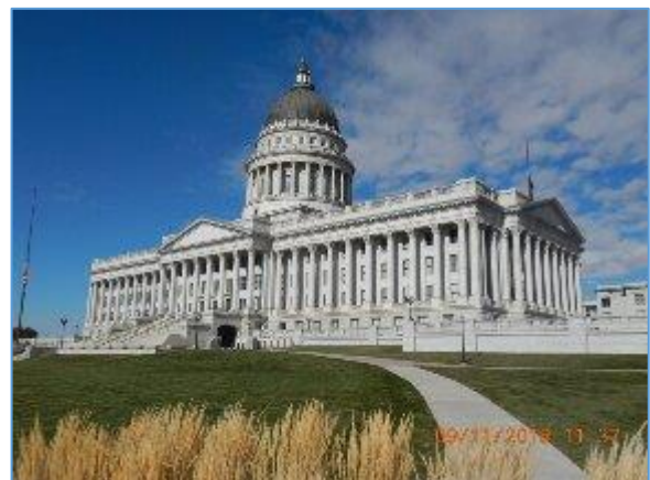
Utah's Capitol Building

Salt Lake City was clear and crisp, and as home to the Mormon religion had some stunning architecture and church-related structures. The Capitol was outstanding and worth a visit, as was the lake itself and Antelope Island. We both purchased a sim card for our phones with an American number so we could use data and send messages. Well worth the US$50 each for unlimited calls in the US and limitless data.