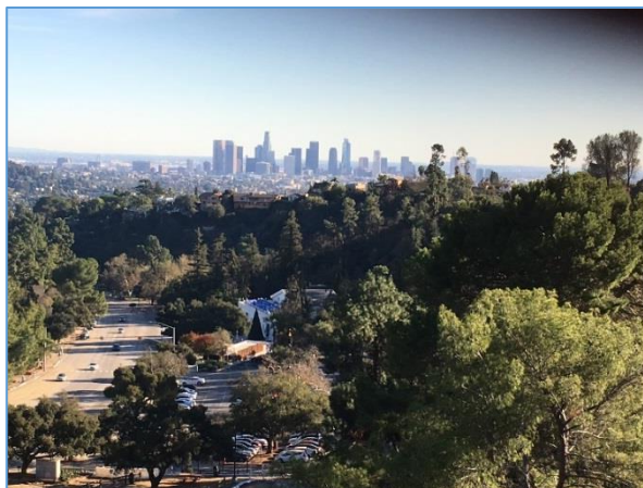
LA downtown on a clear day from the Griffith observatory

A visit to the Griffith Observatory was stellar as it was so clear.