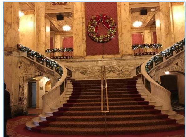
One of many spectacular theatres in Cleveland

It is now a regenerated city bustling with growth and investment. We did a walking tour here which was outstanding. (We love walking tours and have done them all around the world. You tip at the end if you think it was worthwhile. We have not done one anywhere that was not great. Sandermans is one company that does them. ) They took us through the Theatre District that is second only in the US to Broadway in NY. The theatres were superb and dressed up for Christmas.