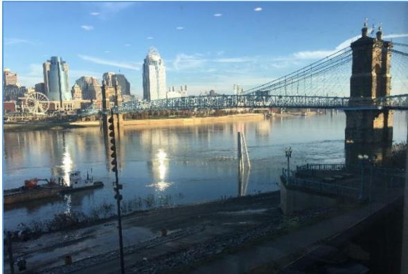
Roebling's bridge over the Ohio River - pre Brooklyn Bridge

We then headed for Cedar Rapids, Iowa and then on to Chicago . Chicago is however the world 'capital' of