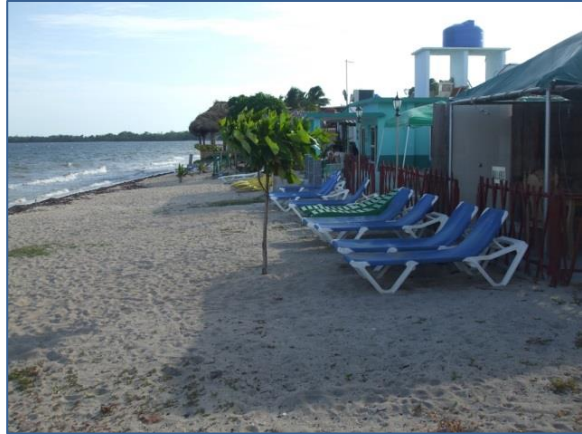
Beach in the Bay of Pigs