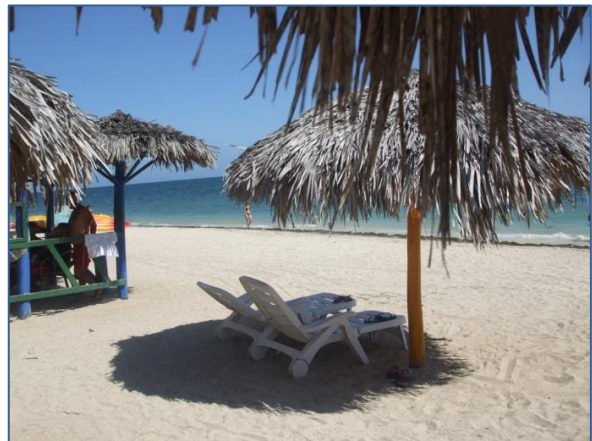
Beach in Trinidad