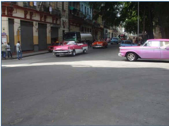
Havana street showing old American cars – they're everywhere!