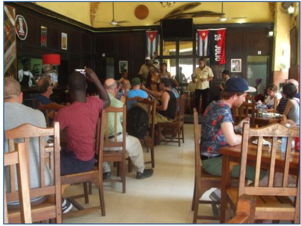
Bar in Havana