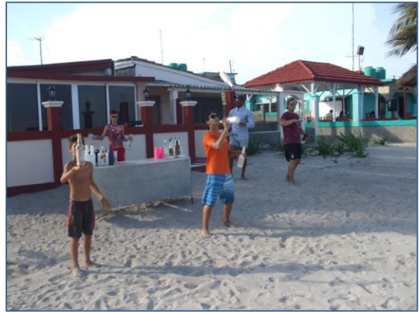
Beach in the Bay of Pigs