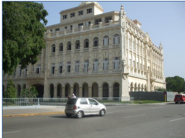
Old building in Havana