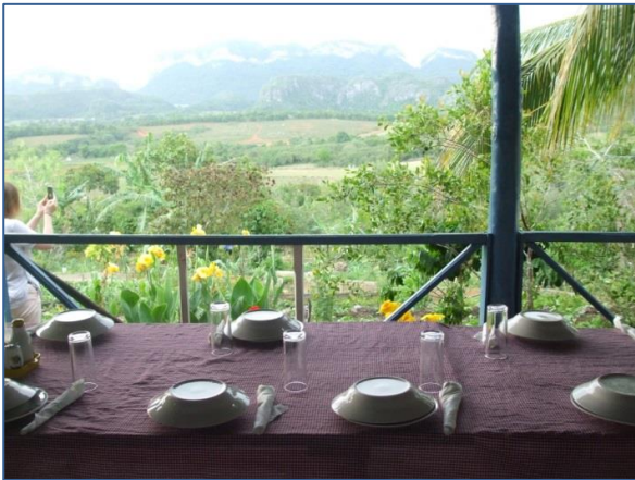
Restaurant in the countryside