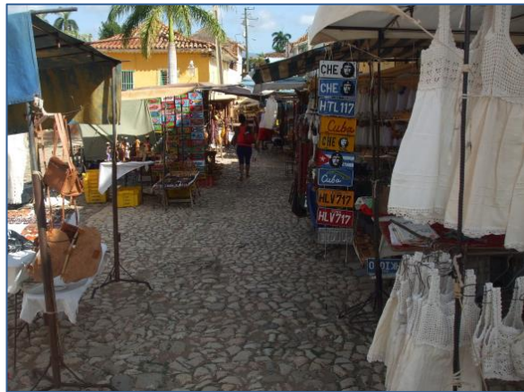
Market in Trinidad, a town on Cuba's South Coast