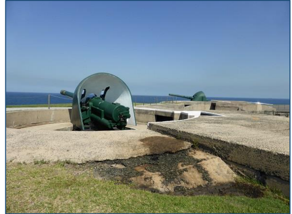
Fort Scratchley Guns

Our farewell lunch was at the Little House on King Patisserie/Café in King Street.