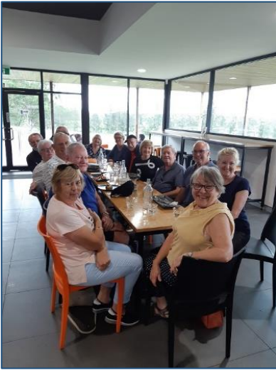
Binnorie Dairy Lunch

Lunch was then next door to Piggs Peake at the Two Fat Blokes Deli-Café . Much-needed exercise was provided for some of us by the walk back to our accommodation.