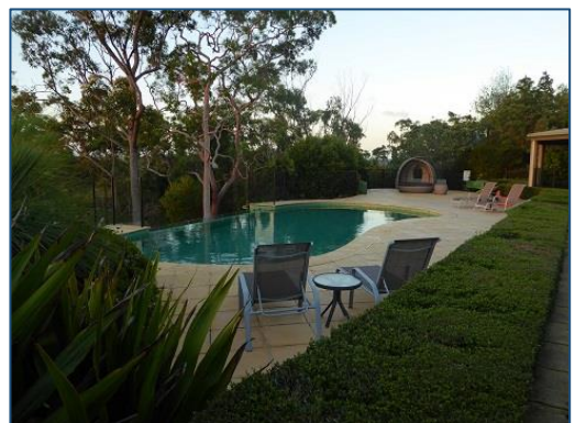
Pool area overlooking the valley