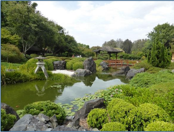
Edogawa Japanese Gardens

We had pre-booked our dinner at The Grand Pavilion Indian Restaurant in Church Street, a short two-block walk from our apartments. The food and service there were exceptional.