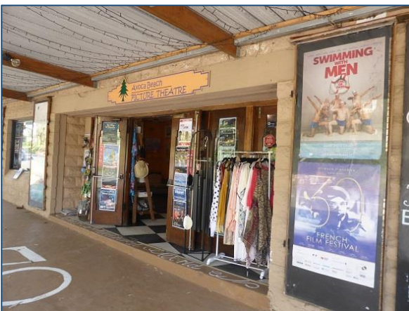
Avoca Beach Picture Theatre

The apartments had a convenient outdoor BBQ area that was large enough to accommodate our afternoon Happy Hour gathering and there were plenty of casual dining options available for dinner including the Florida Beach Bar and Terrace on the lower ground level of the Crowne Plaza Hotel.