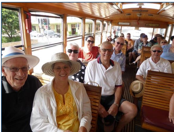
Newcastle's Famous Tram

Our usual Happy Hour was followed by an excellent dinner in Jonah's on the Beach restaurant within the Noah's Hotel.