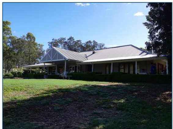
Thistle Hill Guesthouse – main building

The Thistle Hill Guesthouse in Hermitage Road perfectly met our needs. The main facility comprises a single complex with eight private ensuite rooms. There is also a separate cottage with two additional ensuite rooms and kitchen, dining and lounge facilities. A lovely stand-alone breakfast room is located alongside the pool area and our hosts Donna and Stuart provided the most wonderful breakfasts each day as well as excellent service and advice throughout our stay.