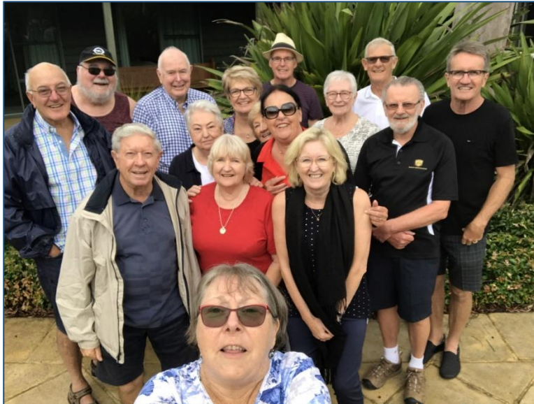
Some of the Ashfield reunion group – with apologies for the selfie pose

As with 2013, these trips were organised by other couples and, although they were great getaways, my notes are therefore quite minimal.