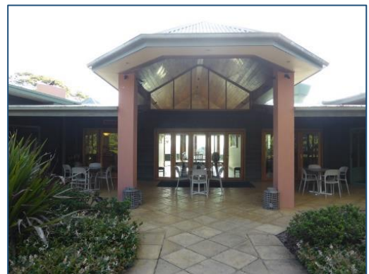
The main entrance to Biram House

Our Monday get-together lunches were held at the Mooney Mooney Club in Kowan Road in 2017 and then at the Mangrove Mountain Memorial Club and Golf Course in Hallards Road, Central Mangrove in 2018. Both venues were excellent, with the latter having the additional advantage of being only 10 minutes south of Noonaweena.