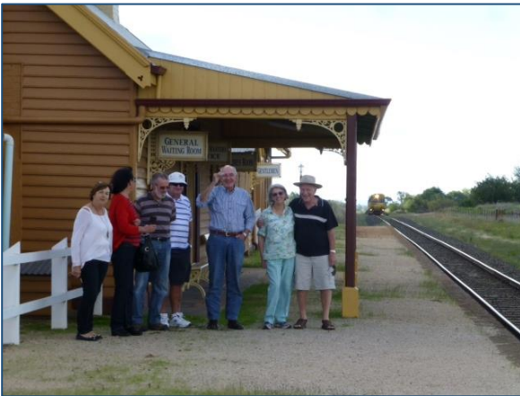
Old Borenore Railway Station

This was one of our smaller group excursions with only nine of our members able to attend. The dates had been chosen to coincide with the Orange F.O.O.D Week , which is now an annual food festival that features the Orange region's diverse and high-quality food and wine through activities such as farm gate tours, wine tasting, cooking demonstrations, picnics, dinners and cabaret.