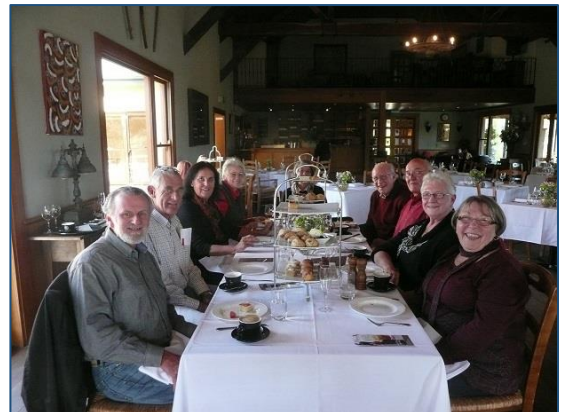
'Bubbles' High Tea at Centennial Vineyards

Our lunch was in the form of an introductory wine tasting which was followed by a 'Bubbles High Tea' . This comprised the obvious glass of sparkling wine and then the anticipated variety of High Tea goodies.