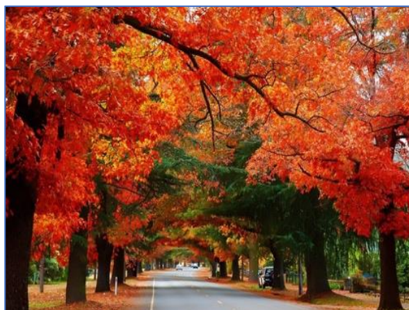
Autumn colours in Bright

The name Mount 'Beauty' is most appropriate for this magnificent area. Our small acreage is in the Tawonga Valley at the base of Mount Bogong (1986 metres high and Victoria's highest mountain) and a ten-minute drive from the Mount Beauty village. With an average annual rainfall of 1250 millimetres, the district has four very distinctive seasons. Snow-capped mountains provide a backdrop in winter and a cool evening breeze brings summer relief. Autumn colours are a sight to be seen and spring gardens are truly beautiful in the alpine area towns. On the odd summer day of forty plus degrees, a half hour drive puts you high in the Alpine National Park with temperatures in the high teens to low twenties.