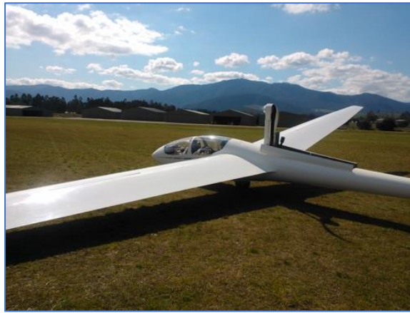
Glider sight-seeing from Mount Beauty

Within an hour's drive of Mount Beauty, a variety of towns attract tourists for outdoor activities and food trails. Mount Beauty is a small village but has outstanding medical services that provide for the ski resorts and local community. The village was originally a hydro village during construction of the Kiewa Hydro System between 1938 and 1961. While attracting many tourists Mount Beauty has maintained its village atmosphere.