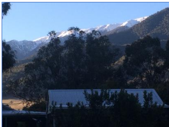
Snow-capped mountain view from our home

After retiring in 2010 my wife and I moved to Mount Beauty, North East Victoria. Why Mount Beauty? While our children were growing up we holidayed in the area and fell in love with the view that greets you as you turn into the Kiewa Valley near Dederang.