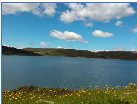
Pretty Valley, Alpine National Park

The name Mount 'Beauty' is most appropriate for this magnificent area. Our small acreage is in the Tawonga Valley at the base of Mount Bogong (1986 metres high and Victoria's highest mountain) and a ten-minute drive from the Mount Beauty village. With an average annual rainfall of 1250 millimetres, the district has four very distinctive seasons. Snow-capped mountains provide a backdrop in winter and a cool evening breeze brings summer relief. Autumn colours are a sight to be seen and spring gardens are truly beautiful in the alpine area towns. On the odd summer day of forty plus degrees, a half hour drive puts you high in the Alpine National Park with temperatures in the high teens to low twenties.