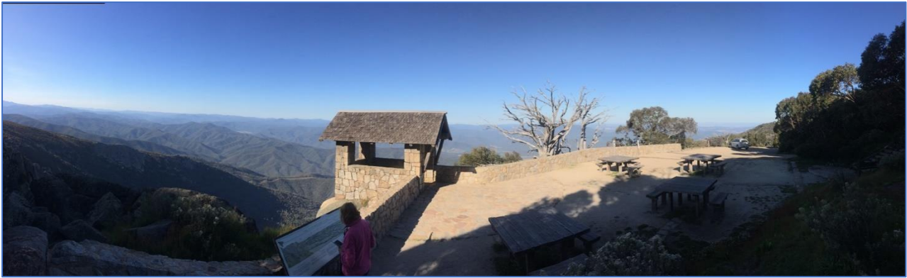
Echo Point, Mt Buffalo