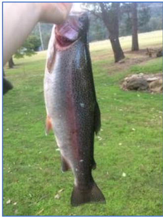
Fresh mountain trout